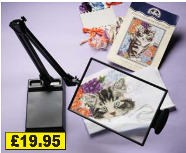
TABLE STAND MAGNIFIER

This easy to assemble table stand magnifier has 2x magnification and is ideal for magnifying books, paperwork, magazines and craft work. It comes with an adjustable lens with 360 degree rotation movable in any direction.